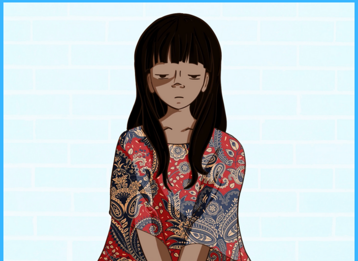
The Gaytriarchy and Why We Need Pride TJ Narula | Australia, 2020. 10' 40"

Yeo-bin and Hae-Kwang are a recently broken-up couple and they are off to meet with a new family for their pet cat. When they arrive, all they find is a remote reservoir and a mysterious locked fridge.